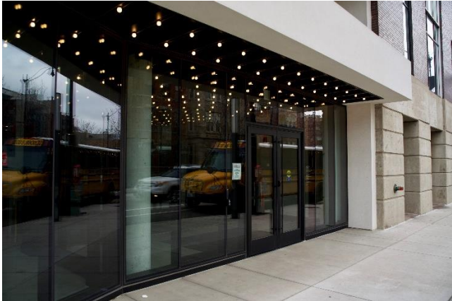
Ensemble Theatre Entrance – 1646 N. Halsted

There are three different entrances into the theater from the street: the Ensemble Theatre Lobby entrance, the Main Box Office Lobby entrance and the Front Bar entrance.